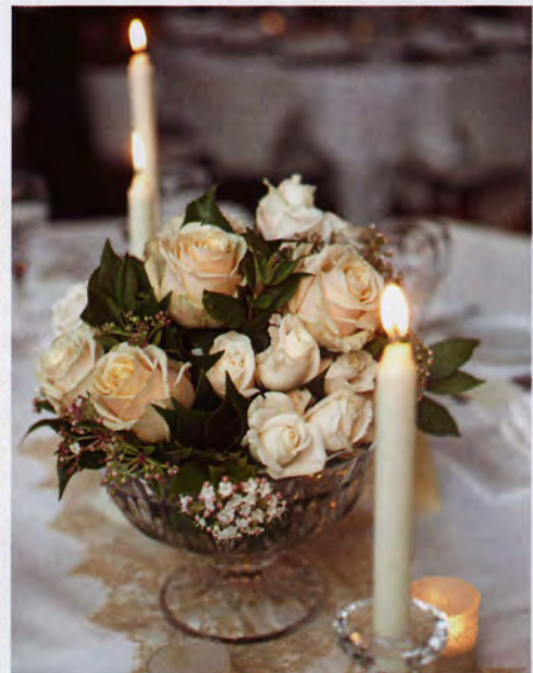
CLOCKWISE FROM LEFT: The wedding cake included a tier of white chocolate mud on top of a base of chocolate mud. “Their photos are so natural and manage to capture a perfect moment to tell a story,” says Tricia of Blumenthal Photography. The reception’s ‘vintage glam’ theme was brought to life by wedding stylists Angels Dreaming, who looked after everything from the invitations to the accessories on the day.